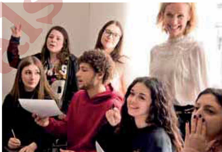
Our friendly and experienced teachers invite you to embark on a journey of learning, discovery and personal fulfillment with us in Munich.