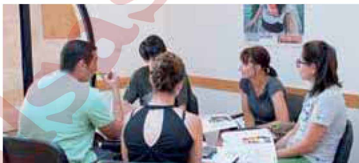
From our well-equipped classrooms and apartments to our peaceful gardens and world class swimming pool, we invite you to a truly inspiring environment.