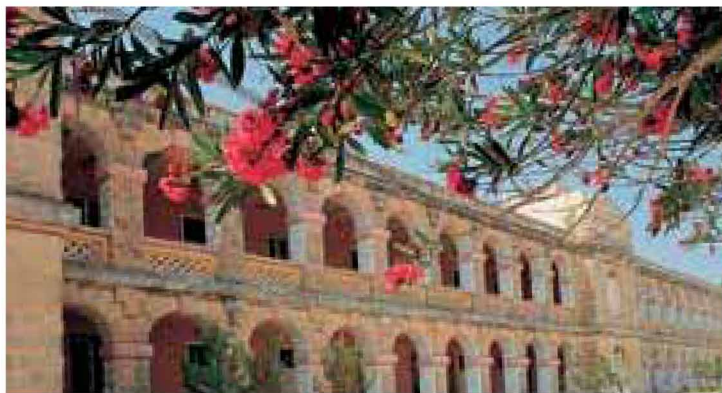
Our breathtaking campus consists of striking limestone buildings which truly captures the spirit of this Mediterranean paradise.

6 weeks starting from 1.615,- EUR Incl. course & accommodation