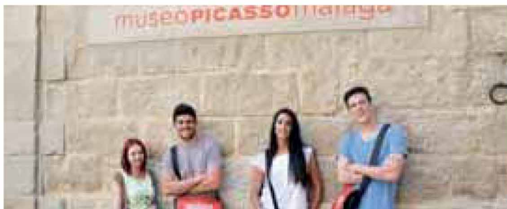
Of course, in Málaga you spend a lot of time at the beach. But the museums – such as the Museo Picasso – are well worth seeing as well.