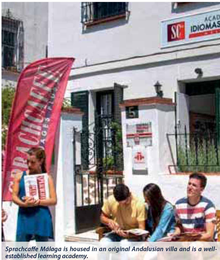
Sprachcaffe Málaga is housed in an original Andalusian villa and is a well-established learning academy.

It goes without saying that Costa del Sol is described as one of the favourite destinations – sunshine guaranteed.