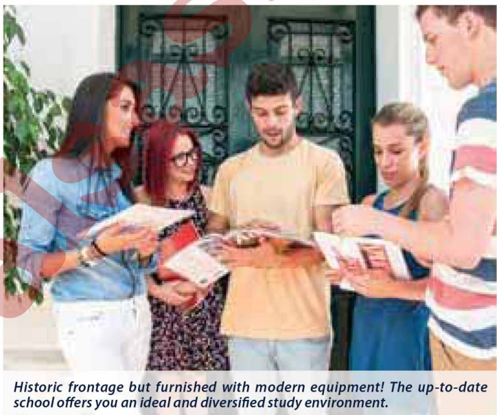
Historic frontage but furnished with modern equipment! The up-to-date school offers you an ideal and diversified study environment.