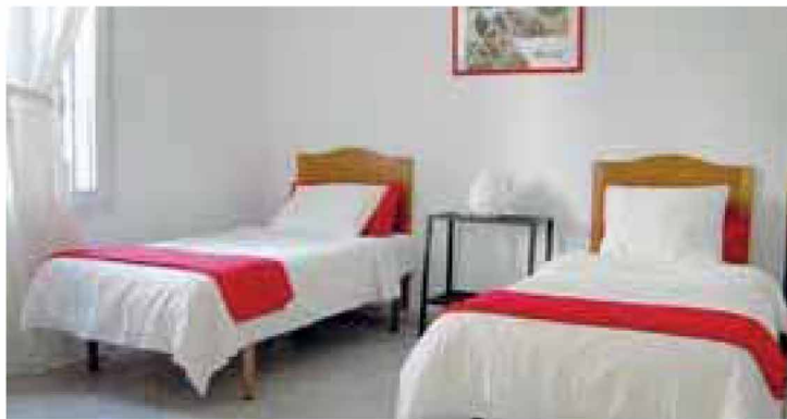
Apartment, studio or host family – you are spoilt for choice. All options are centrally located and within 5 minutes of the beach, city centre and everything else you need!