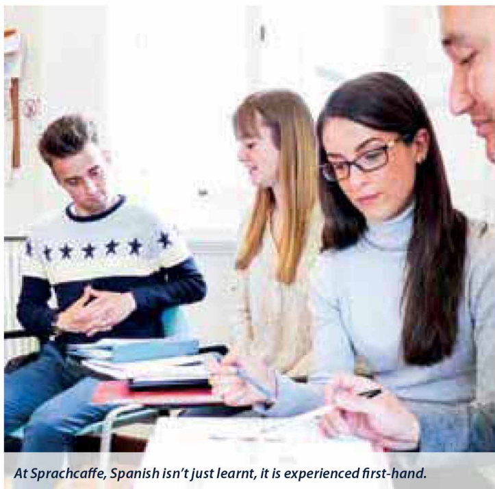
At Sprachcaffe, Spanish isn't just learnt, it is experienced first-hand.