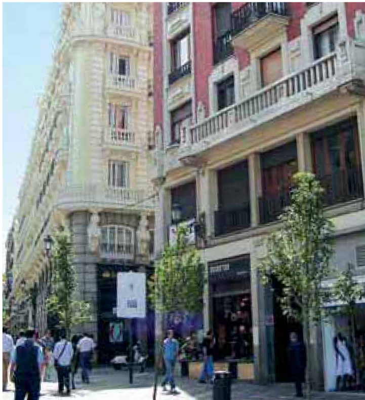
Situated in the heart of Madrid, next to the Puerta del Sol and 'Kilometre Zero', you will find Sprachcaffe in an awe-inspiring turn-of-the-century listed building.

At the very centre of Spain, the capital city Madrid truly embodies both bustling culture and Spanish flair.