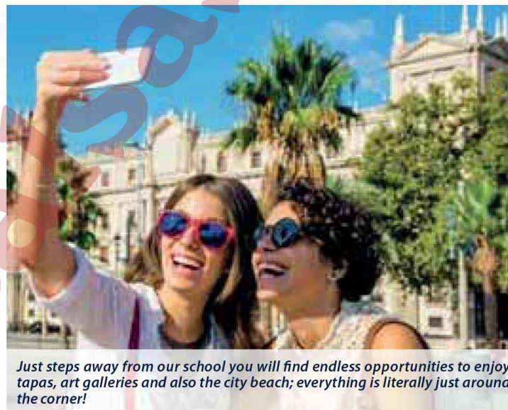
Just steps away from our school you will find endless opportunities to enjoy tapas, art galleries and also the city beach; everything is literally just around the corner!