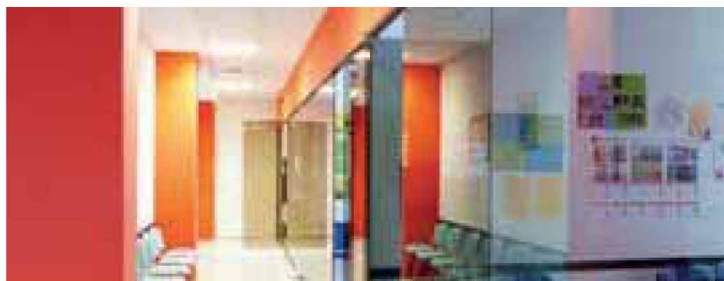
For some, Barcelona is Europe's most beautiful metropolis. The city, like our school, doesn't leave any wish unfulfilled, except maybe to return as soon as possible.