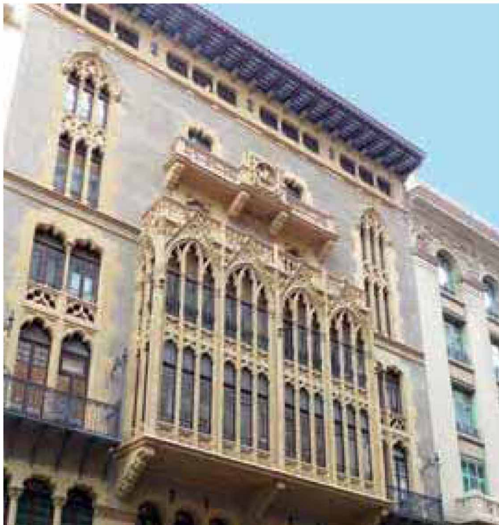
Within easy reach of La Rambla, the city's world famous shopping boulevard, Sprachcaffe Barcelona offers the perfect balance between cultural discovery, shopping and a successful learning outcome.

Cataluña's capital is without doubt one of the most popular, beautiful and culturally-rich cities in Europe.