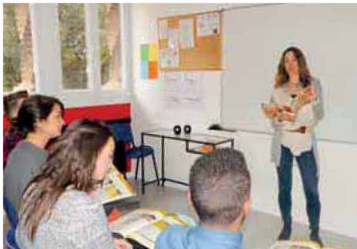
The teaching concept in our institute also mirrors the image of this open and modern city!

6 weeks starting from 1.450,- EUR Incl. course & accommodation